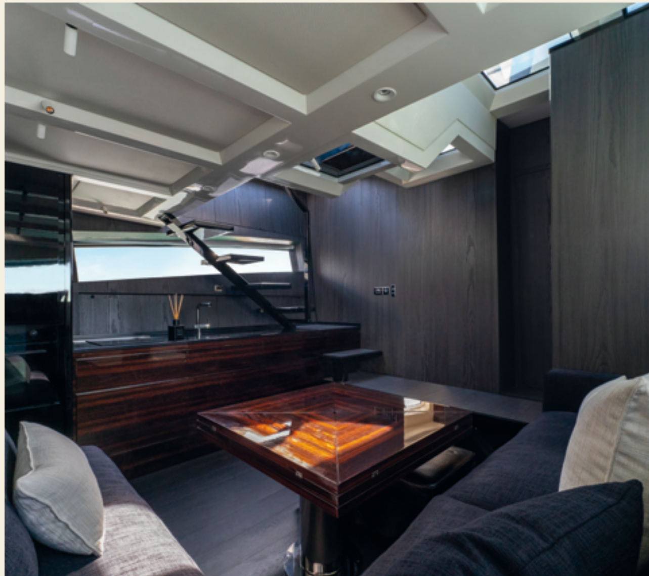
An elegant steel and oak staircase connects the outdoor spaces to a large living area amidships equipped with a kitchen and a large corner sofa with a petal-shaped coffee table, which can be transformed into an eight-seater dining table.