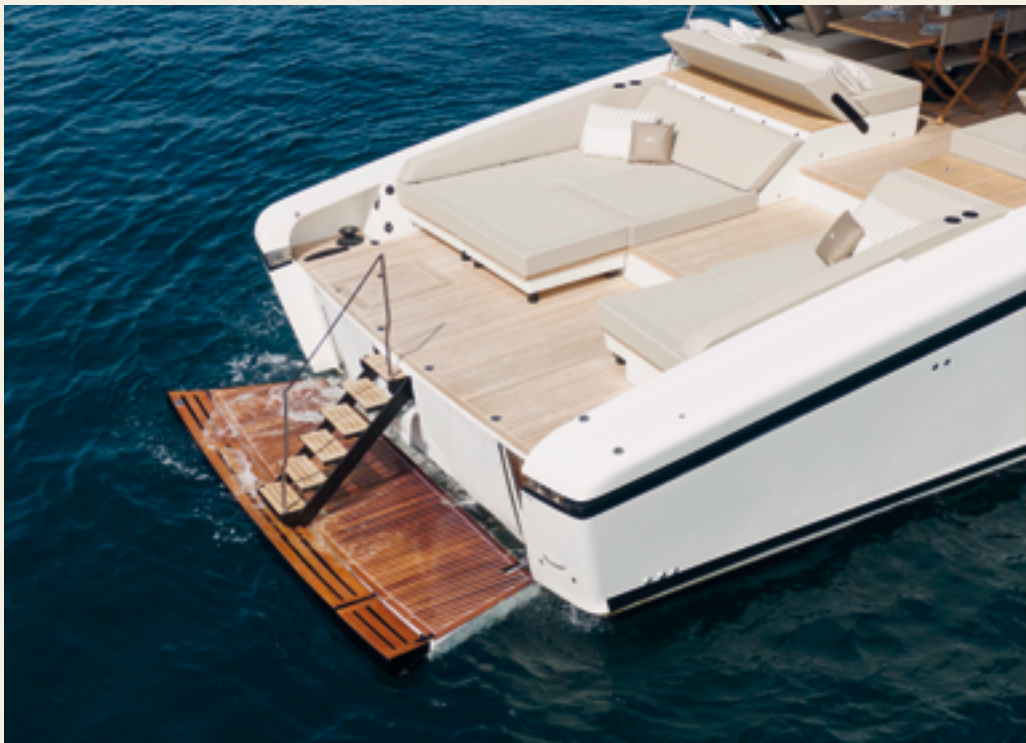
On board the P58, the descent into the water is a ritual, a moment of profound connection with the sea.